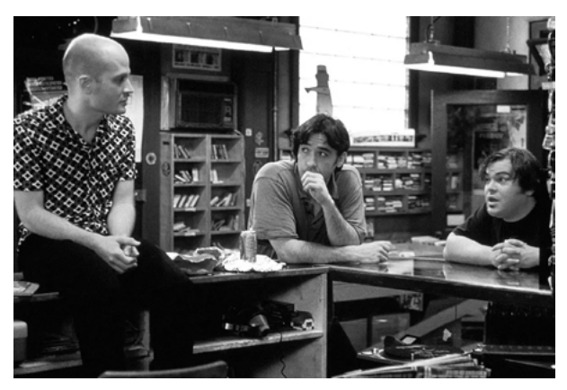
High Fidelity (2000, dir. Stephen Frears)